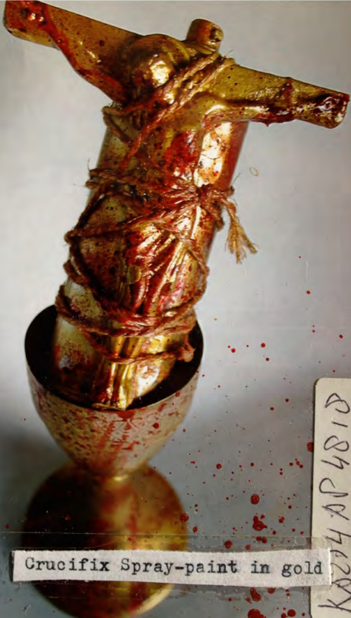
Crucifix Spray-paint in gold